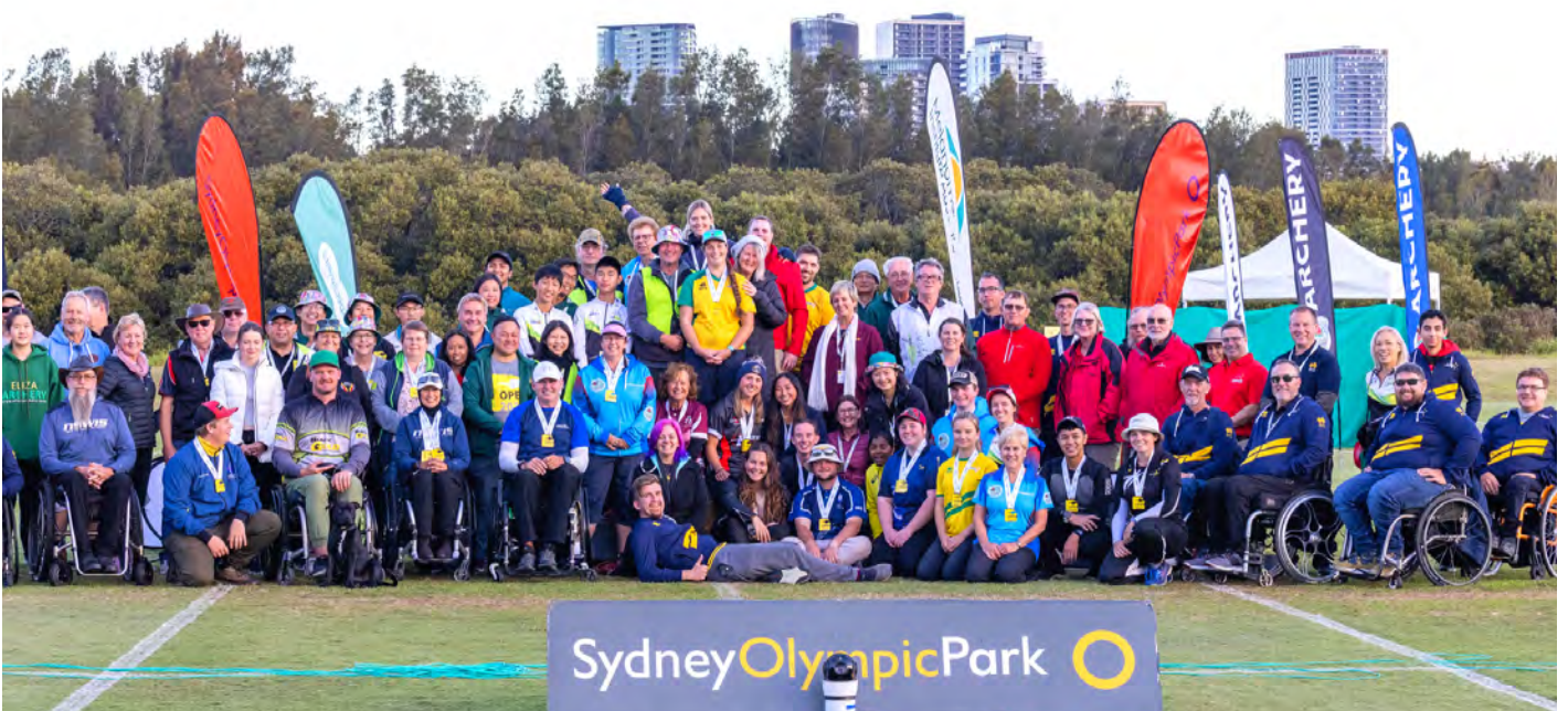
2021 Australian Open Medallist

This report provides a day by day summary including competition results and highlights.