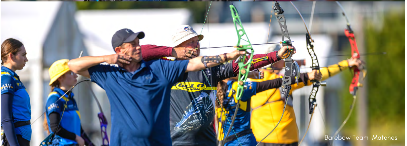
Barebow Team Matches